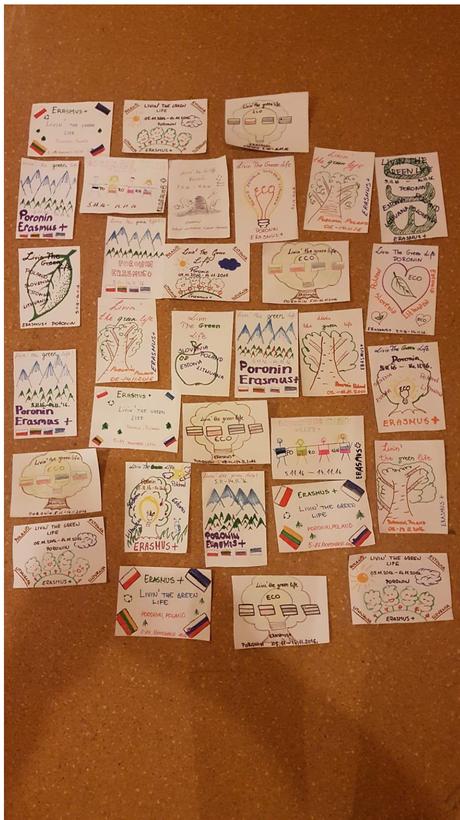
Project "Livin' The Green Life!" number 2016-2-PL01-KA105-026944 co-funded by the Erasmus+ programme of the European Union