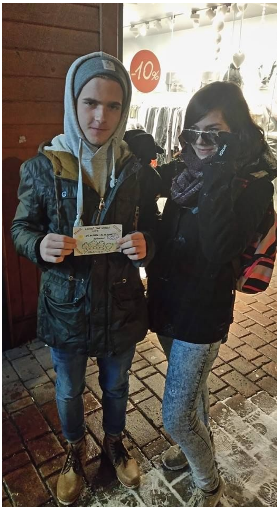
Project "Livin' The Green Life!" number 2016-2-PL01-KA105-026944 co-funded by the Erasmus+ programme of the European Union